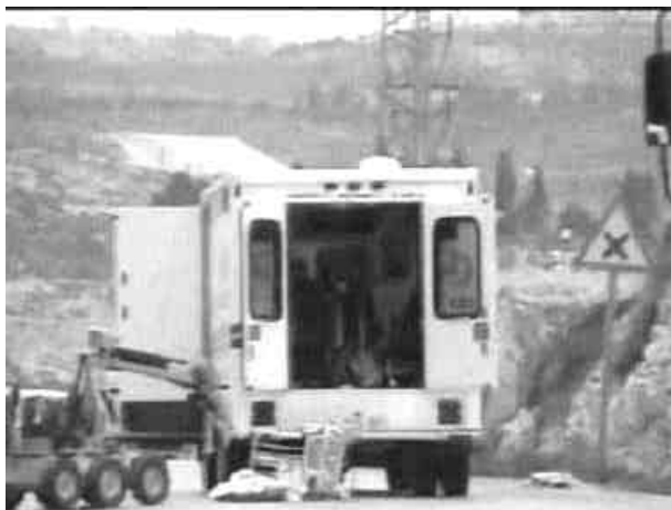
Unloading an the explosive belt from a Palestinian ambulance on 3-27-02