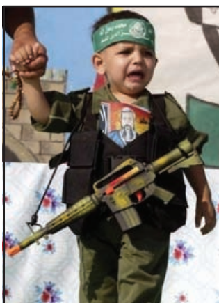
This is a child of a Hamas supporter. Public incitement, years of propaganda and Islamist movements have radicalized many Palestinians and their children.