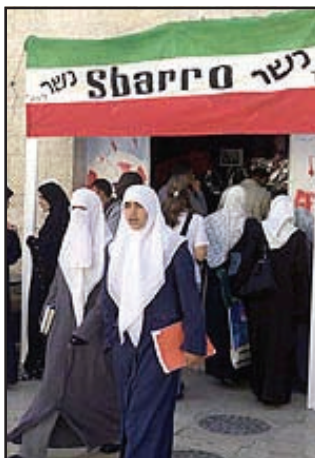
An on-campus event at An-Najah University in Nablus fondly commemorates the Sbarro Pizzeria Massacre, where a Palestinian suicide bomber killed 15 Israelis (including 7 children) and wounded 130 more while they were eating.