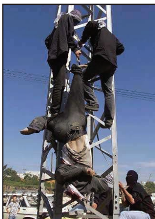
The lack of law enforcement in the Palestinian territories allows armed gangs to intimidate and murder at will. Here a man is killed and hanged for being a "collaborator." It is not known if this was his true offense.