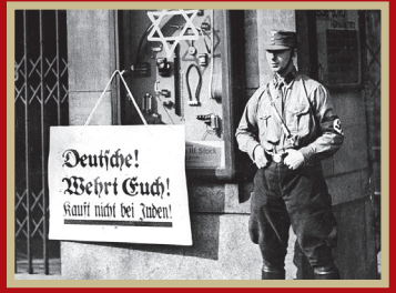
Boycotting Jews, Berlin, 1933