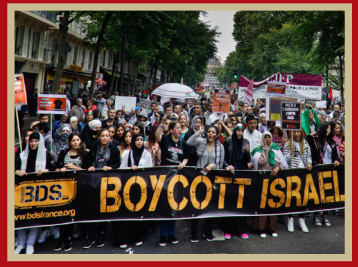
Rally Against Israel