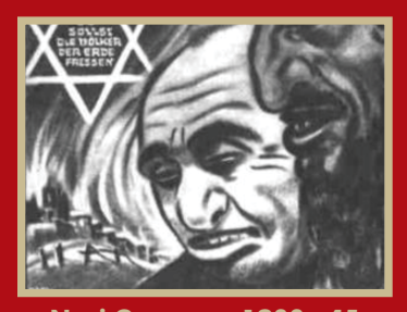
Nazi Germany, 1933-45