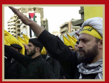
Hezbollah Rally, Beirut