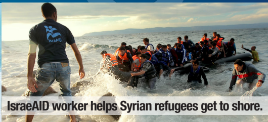
IsraeAID worker helps Syrian refugees get to shore.

Israel is a world leader in innovation and humanitarian aid. Israelis are helping people all over the world overcome hunger, disease, water scarcity, war, terrorism, natural disasters, environmental degradation, cyber threats, and much more.