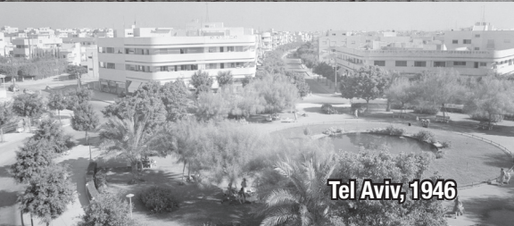
Tel Aviv, 1946