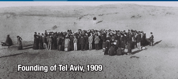
Founding of Tel Aviv, 1909

For decades, beginning in the late 1800s, waves of Jews returned to the land of Israel to rejoin those who were already there and rebuild their nation. They drained swamps, built cities and farms, revived Hebrew as a spoken language, and created the institutions necessary for a state.