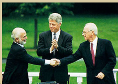
Israel-Jordan Peace Treaty