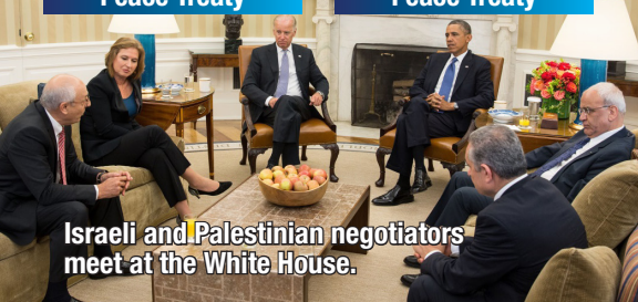
Israeli and Palestinian negotiators meet at the White House.

Israel made peace with Egypt in 1979 and Jordan in 1994. Israelis have agreed to or offered at least four major proposals to end the conflict with the Palestinians and help create a Palestinian state. Palestinian leaders have said no each time, to the detriment of both peoples.