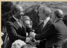
Israel-Egypt Peace Treaty