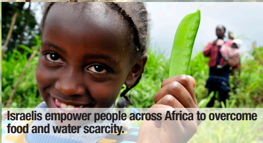
Israelis empower people across Africa to overcome food and water scarcity.